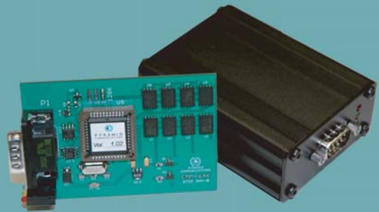
Extended Memory Module